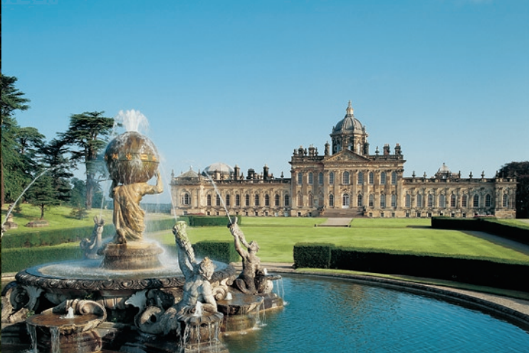
Atlas Fountain, Castle Howard

The Howard family have lived at Castle Howard for three centuries. Today Castle Howard is a modern working Estate of 10,000 acres. More than 6,000 acres of the Estate are given over to agriculture. Environmental stewardship is at the heart of the wider management of the Estate and includes schemes for regeneration of hedgerows. Forestry is also an important activity, with nearly 2,000 acres of woodland (divided equally between coniferous and deciduous plantings) which are managed for commercial timber production, amenity and wildlife value. In April 2006, Castle Howard was given UKWAS accreditation: the UK Woodland Assurance Scheme (UKWAS) recognises forests and woodlands which are managed to the highest standards.