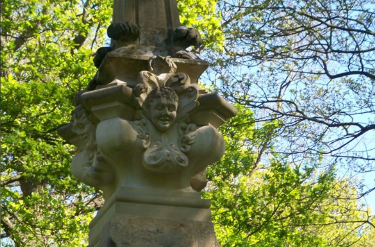
The Four Faces monument