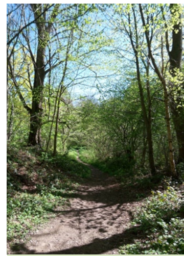
The footpath through Pretty Wood is used when following the Purple Route. The wood is a SINC. It contains three types of oak: pedunculate, native hybrid and Turkey. The ground flora is dominated by a carpet of bluebells in April and May.